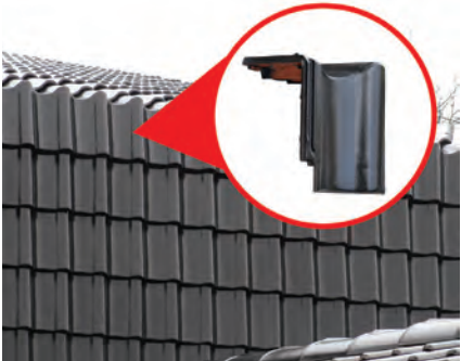
➤ Crest Nelskamp specifically designed 70° angle H14 black clay roofing tile.

and roofing tiles required for a project of this magnitude were extremely useful when working alongside the architects. The Crest Nelskamp H14 interlocking clay pantile finished in black gloss was the preferred choice for the project. With a covering capacity of only 14 tiles per square metre, it was installed very economically, however, the roof design presented some challenges, several tailored tiles were designed in order to deal with the intricacies of the mansard roof shape. The Crest team and the architects organised a visit to Nelskamp in Germany, Crest's European manufacturing business partners. Continues on back page >