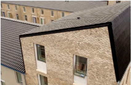
➤ The unique roofing system flows without interruption continuously from eave to ridge.